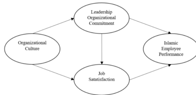
Figure 1: The Framework of the Research

variables, including organizational culture, organizational leadership commitment, job satisfaction, and Islamic bank's employee performance in Indonesia. The detail of the framework of the study is provided in Figure 1.