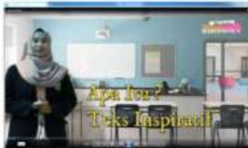
Figure 8. Results of learning development with the power director application