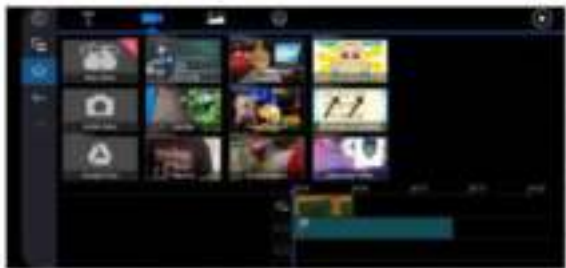
Figure 6. The display of the power director combines basic views and learning videos