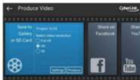
Figure 9. Display of the produce video of the power director application