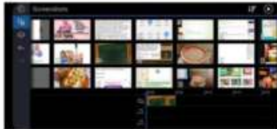
Figure 5. A basic view of the power director