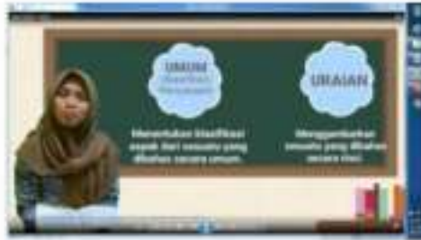
Figure 2. Display of learning videos through the power director application