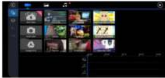
Figure 4. Timeline view