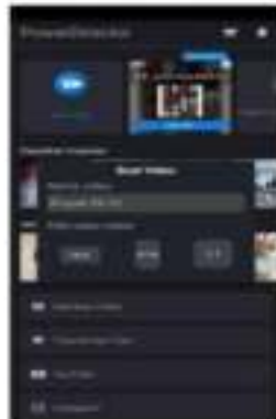
Figure 3. Display of the power director application