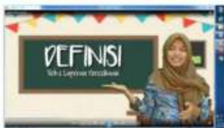
Figure 1. Display of learning videos through the power director application